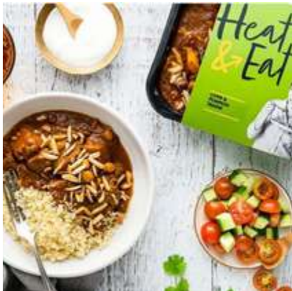
Ready to Eat Meals